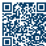
Bridle Pro® Family

For a complete list of products, visit us at www.AppliedMedical.net 800 869 7382 | CS@AppliedMedical.net | ICS@AppliedMedical.net